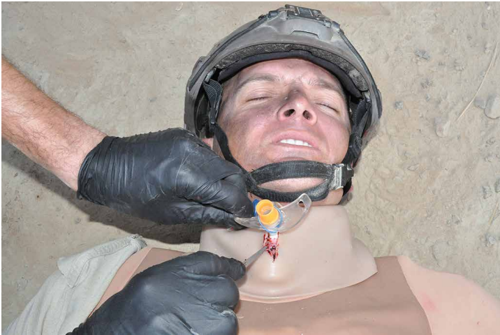
Field Expedient Cricothyroidotomy