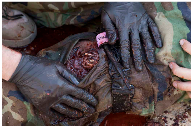
Hemorrhage Control - Leg